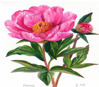
Paeonia J. Zehn

Tickets are refundable until 03-23-24. Tickets are transferable.